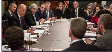
Federal Task Force