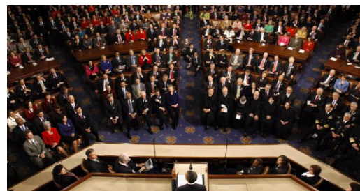
2016 State of the Union Address