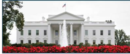
Vice President's Office